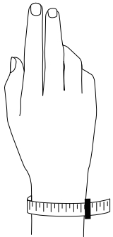
Using the Cartier paper sizer